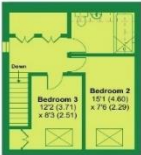
BARN A FIRST FLOOR